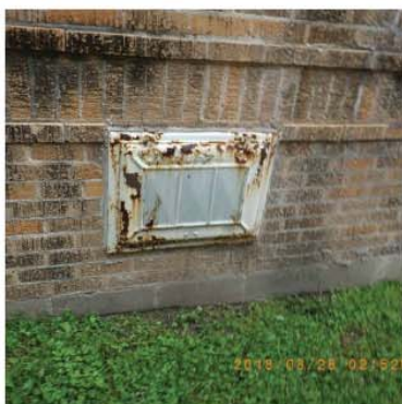
304.6 Exterior Walls