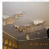
305.3 Interior Surfaces