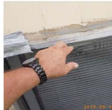
304.14 Insect Screens