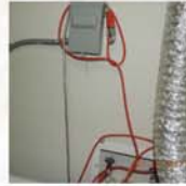
604.3 Electrical System Hazards