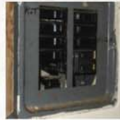
604.3 Electrical System Hazards 605.1 Installation Electrical Equipment