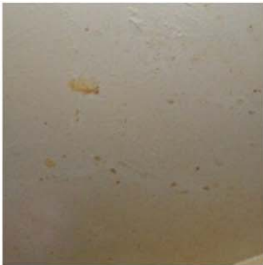
305.3 Interior Surfaces