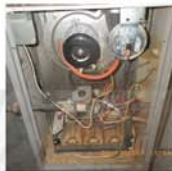
603.1 Mechanical Appliances