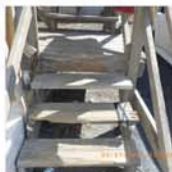
304.4 Structural Members 304.10 Stairways Decks Porches and Balconies