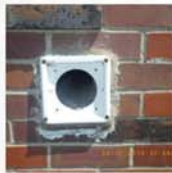
403.5 Clothes Dryer Exhaust