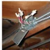
604.3 Electrical System Hazards 605.1 Installation Electrical Equipment