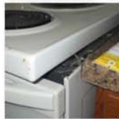
305.1 General Interior Structure 48.18 Requirements Not Covered by Code Unsafe Conditions