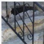
304.6 Exterior Walls 304.5 Foundation Walls 304.10 Stairways Decks Porches and Balconies