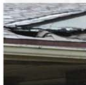
304.7 Roofs and Drainage 304.4 Structural Members