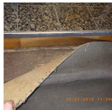
305.3 Interior Surfaces