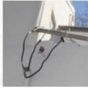
604.3 Electrical System Hazards 605.1 Installation Electrical Facilities