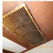
607.1 General Duct System