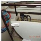
504.1 General Plumbing Systems and Fixtures 504.3 Plumbing System Hazards