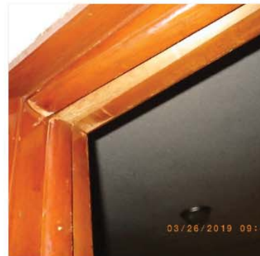
304.13 Window Skylight and Door Frames