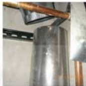
603.2 Removal of Combustion Products Mechanical Equipment