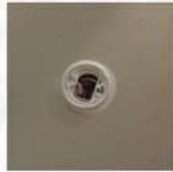
704.1 General Fire Protection Systems 704.2 Smoke Alarms