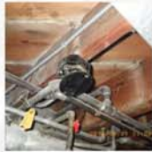
604.3 Electrical System Hazards 605.1 Installation Electrical Equipment