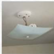
604.3 Electrical System Hazards 605.1 Installation Electrical Equipment