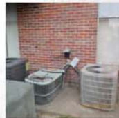
603.1 Mechanical Equipment 604.3 Electrical System Hazards 605.1 Installation Electrical Equipment