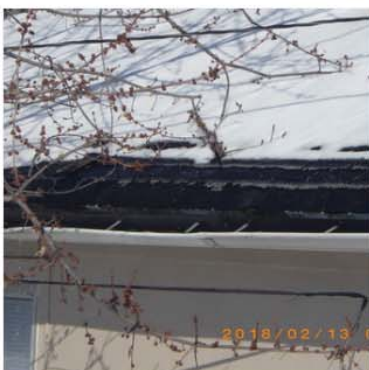
304.7 Roofs and Drainage