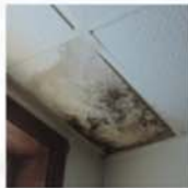
305.3 Interior Surfaces Unsanitary Surfaces