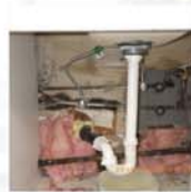
504.1 General Plumbing Systems and Fixtures 504.3 Plumbing System Hazards