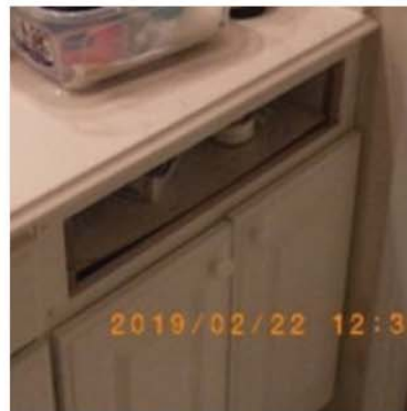
305.3 Interior Surfaces