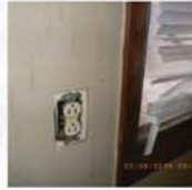
604.3 Electrical System Hazards 605.1 Installation Electrical Facilities

Structural/fire/severe storm damage Interior/mechanical/plumbing/electrical