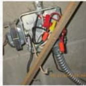
604.3 Electrical System Hazards 605.1 Installation Electrical Equipment