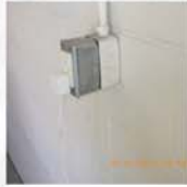
604.3 Electrical System Hazards 605.1 Installation Electrical Facilities