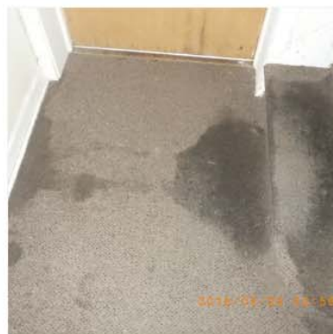
305.3 Interior Surfaces