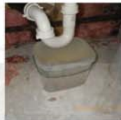
504.1 General Plumbing Systems and Fixtures 504.3 Plumbing System Hazards