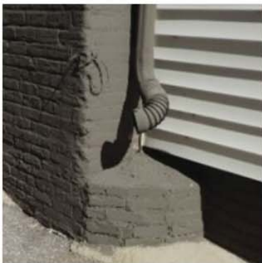
304.7 Roofs and Drainage