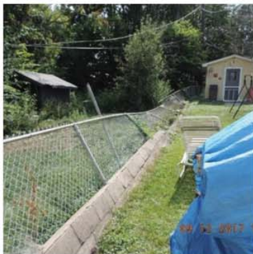
302.7 Accessory Structures